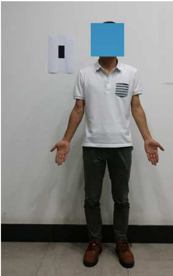
Fig. 1. Photographic method.

Sitting posture: The testee sitting lift up the head in the plane that adjusted to the height of the fibular head and head positioning through eye ear plane, eyes look straight ahead, left and right thigh roughly parallel and knee flexion is a roughly rectangular, feet placed on the ground, hands on his lap gently. Make sure the correct posture that the testee's buttocks, back should be simultaneously on the same vertical lead.